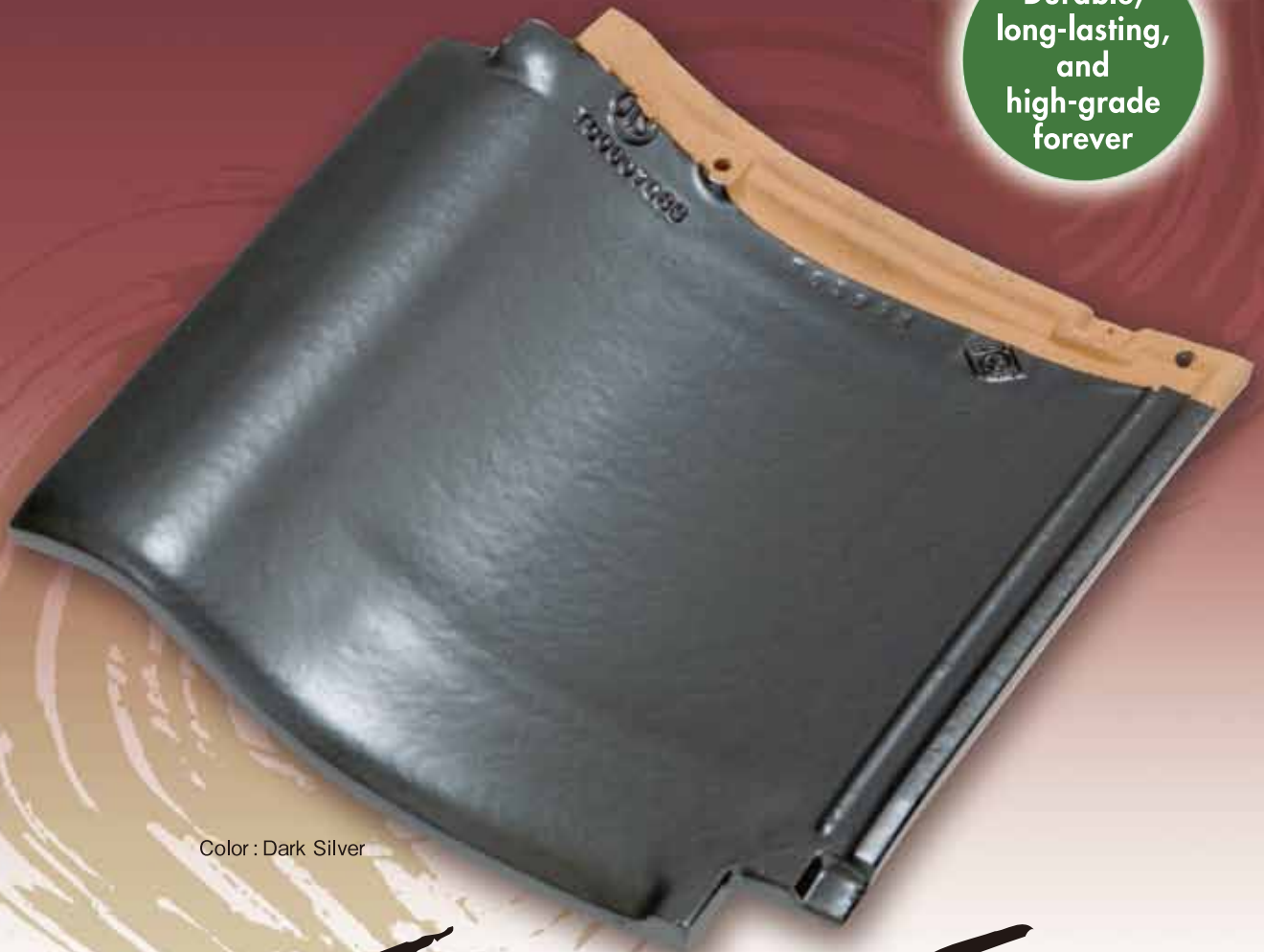
Color : Dark Silver

Durable, long-lasting, and high-grade forever